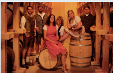
Team – Waldbrand GmbH