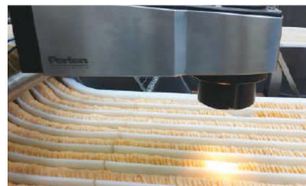
Sensor scanning crackers