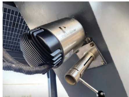
Sensor measuring soybeans

Performance of modern in-line sensors equal or surpass that of laboratory methods, yielding results with higher precision in real time for continuous automated control. This enables manufacturers to significantly reduce variability in production. With smaller variations, one can drive product specifications closer to the permissible limits, save on energy for drying processes, potentially increase production rate and optimise the use of raw materials.