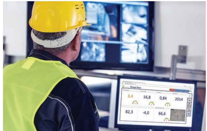
User interface for In-Line NIR on site

An additional advantage on these systems is that the calibrations can be used on the benchtop version NIR DA 7250 that could be used at line or in the lab.